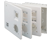
KIT SCB (TRAS.F.E.C.) Code 22481